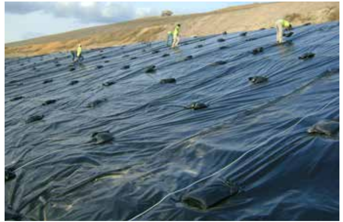
Temporary Rain Shed Cover