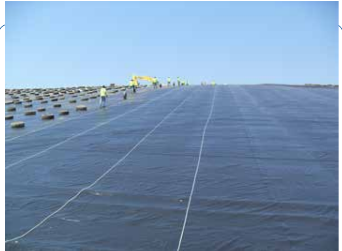
Temporary Rain Shed Cover