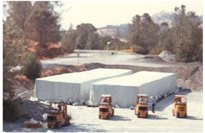
Construction Site Covers