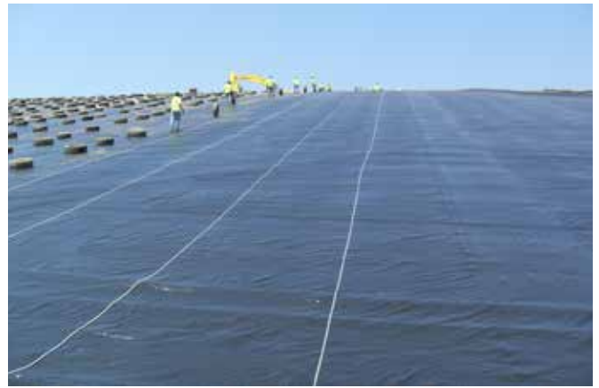
Temporary Rain Shed Cover

DURA♦SKRIM® R24BV is available in a variety of widths and fabricated panels up to 80,000 square feet. All panels are manufactured in a quality controlled environment and are accordion folded and tightly rolled on a heavy-duty core for ease of handling and time-saving installation.